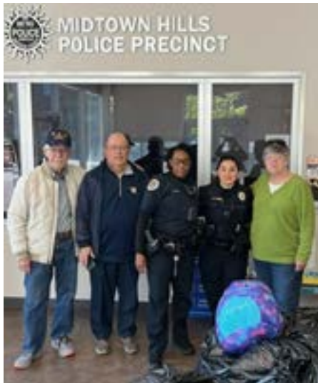
Above: A delivery to the Midtown Hills Police Precinct. Right: the 400 stuffed animals collected!

The Women in Mission group at Our Savior Lutheran Church (OSLC), Nashville, have developed a bond with the local emergency responders. Every month, home baked cookies are delivered to the Midtown Hills Police Precinct of Nashville, and Fire Station 27. Throughout the month of March, this group, with the help of the congregation and academy, collected over 400 stuffed animals that were delivered to the Midtown Hills Police Department. The stuffed animals are kept in the trunks of patrol cars to provide comfort to children in crisis situations.