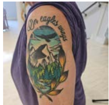
Figure 4 On Eagles Wings

"No matter what trial I am facing or going through, I know that it is just temporary, and God will see me safely through it. Not all who wander are lost —God has set me on the right path. Sometimes I wander away from that path, but I know what I must do to get back on track."