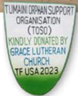
Clockwise from left: old house, new home, plaque of recognition.