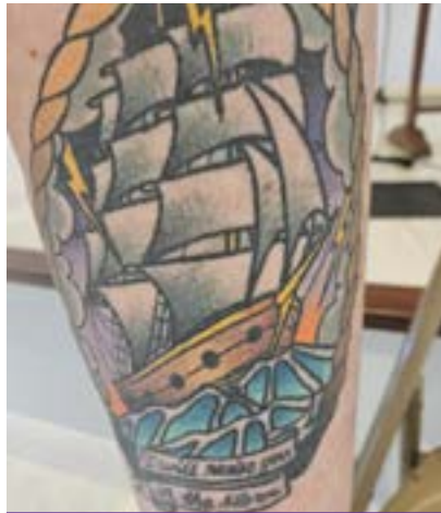
Figure 1 I will Praise You in the Storm